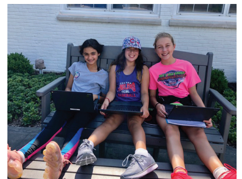
Students work on laptops in the courtyard.