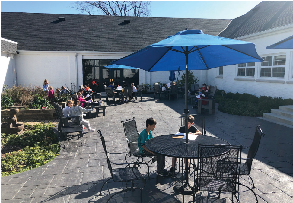
Students complete school work in the courtyard under the fall sun.

Bannockburn School recently expanded the number of classrooms available for students without a building addition. Instead, the courtyard has been upgraded by adding seating areas and landscaping so that teachers can utilize the space for student lessons.