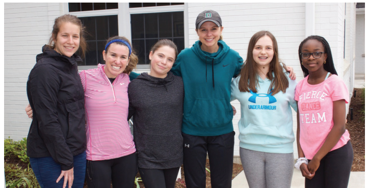
Students in the running club that started this year have learned many exercise and life lessons.