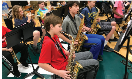
Students participate in many fine arts activities including band.

“Often the fine arts classes are a time where we really see students shine,” says music teacher Liz Ciko. “It isn’t always easy to see some of the talents that our students have when they are working in a traditional classroom setting. When they are given the tools, time and permission to be creative and inventive with their learning, they are more willing to show their authentic selves and share their talents with not only their teachers, but an audience.”