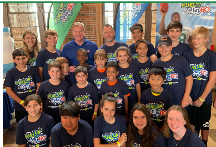
Student volunteers photographed with NFL Commissioner, Roger Goodell.

To participate in this event, over 40 students traveled to Douglas Park in Chicago. Students were greeted by NFL and FUTP60 ambassadors as they gathered in the Douglas Park Community and Cultural Center. From there, students had