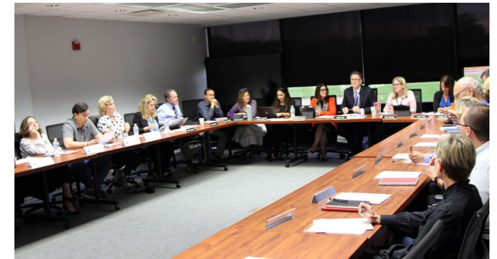
Boards of Education from Bannockburn District 106, Deerfield District 109, North Shore School District 112 and Township High School District 113 partnering together.

“Sharing these resources means that our students will be familiar with the policies and procedures from the time they