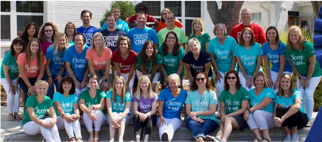
Bannockburn staff recognized for the 2019 National Blue Ribbon School of Excellence Award.