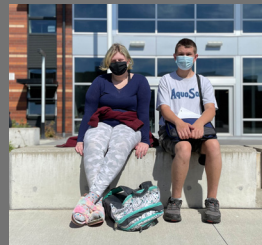
Two high school students sit outside on a sunny day during lunch on the first day of school, September 2021.

Lakewood school leaders believe students should still be able to experience a sense of normalcy despite the pandemic. During these first weeks of classes, students and staff are fully masked, standing