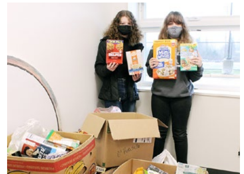
LHS students collected 884 items for the food bank in December.

In December, Lakewood High School students collected 884 items for the