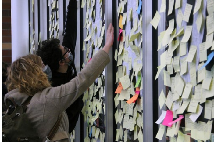
Lakewood High School's student leadership organized an "I Have a Dream" space on the library window for students to write their dreams for themselves and for their community.