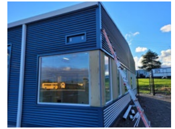
Construction on an addition at the Lakewood Support Services Center is expected to be complete in late spring.

Currently, employees are spread out among four small