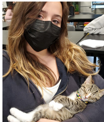
Animal Biology students and FFA club members help care for foster kittens from the NOAH animal shelter.

She plans to partner with local veterinary clinics for student internships. The class will also offer industry certification for