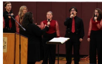
Each school's Veterans Day assembly varied, but paying tribute to our veterans with student musical performances was a key element and allows for us to give thanks to our veterans for their sacrifices and service to our country. Top photo: Lakewood Middle School symphonic band plays the "Star Spangled Banner." Left: Cougar Creek Elementary students perform "Sing America Sing." Right: Swingbeat jazz choir performed two songs. Listen at https://bit.ly/3FZ3KMP .