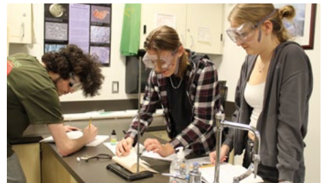
Students test the properties of different chemicals to identify them during chemistry.

Motivated high school students have options when it comes to earning college credit. One option, College in the High School, is a cooperative program between Lakewood and Everett Community College. Courses are taught by Lakewood teachers who work closely with EvCC faculty mentors to ensure the work the students perform in the high school course is equivalent to a similar course taught on campus.