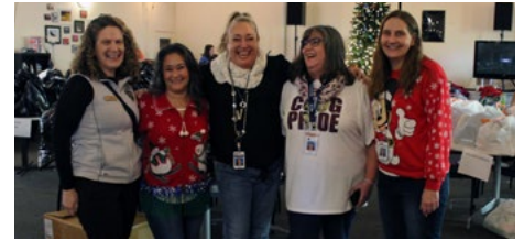
Setting up for Holiday Helpers at Linc Northwest.

Food Bank, and Linc Northwest. Thank you to everyone who partnered with us to serve our families.