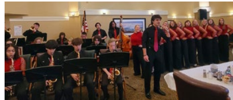
Lakewood High School jazz students perform at Windsor Square Senior Home on Dec. 11. Students visited with residents after the performance and gave them holiday cards.

A donation from Astound Broadband provided gift cards for groceries. Toy drives were organized by Coastal Community Bank, Apex Performance and Fabrication, Jamestown Saloon, Marysville