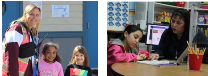
Each day, classified staff across our district diligently work with a focus on each student being fully supported and having access to what they need to grow, learn, and thrive. Thank you to our education support professionals!