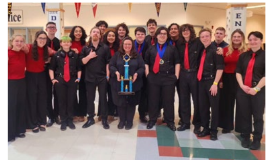
Above: At Commencement Bay Jazz Festival, Swingbeat jazz choir was awarded the overall grand champion award for best vocal group, competing against larger schools. The 11th Avenue jazz band took second place in its division and received two solo awards in the preliminary round. Swingbeat had an unprecedented seven solo awards in the preliminary round.