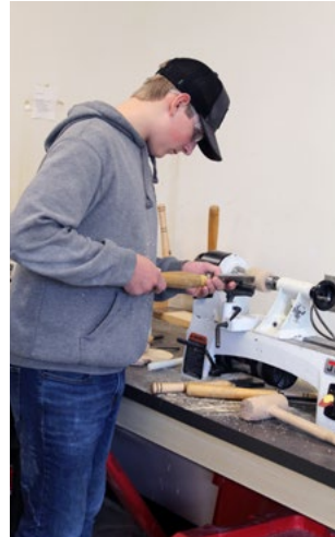
In Core Plus Construction at LHS, students learn construction, teamwork and communication.