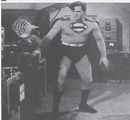
Alyn playing his role as Superman in the film serial.

Kirk Alyn (1910-2000), the first on-screen Superman, was born in Wharton.