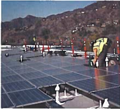
John Muir MS

The installation of solar equipment was completed at nine (9) sites. The solar panels installed at Emerson ES, Harte ES, Jefferson ES, Washington ES, and Luther MS were installed on the playgrounds and provided the added benefit of shade in the play area. The solar panels installed at Jordan MS and Burbank Adult School were installed in the parking lots and also had the advantage of furnishing shade to park under. The last two (2) sites, Muir MS and the District Service Center, had their solar panels mounted on the roof.