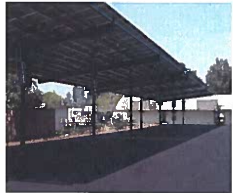
Luther MS Solar Panels

The installation of solar equipment was completed at nine (9) sites. The solar panels installed at Emerson ES, Harte ES, Jefferson ES, Washington ES, and Luther MS were installed on the playgrounds and provided the added benefit of shade in the play area. The solar panels installed at Jordan MS and Burbank Adult School were installed in the parking lots and also had the advantage of furnishing shade to park under. The last two (2) sites, Muir MS and the District Service Center, had their solar panels mounted on the roof.