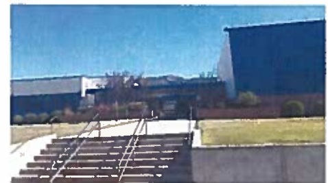
Thomas Jefferson ES

The exterior of two (2) school facilities, Washington ES and Jefferson ES were painted using deferred maintenance dollars.