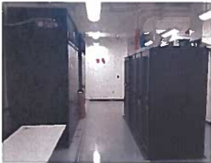
District Data Center

The District installed network cabling and wireless access points at Burbank HS, Burroughs HS, Muir MS, Luther MS, and Adult School. In addition, a new Data Center was constructed at the District Service Center. This includes a dedicated room for the new District IT racks which house new servers, switches, routers, and fire wall. Also included in the Data Center is an uninterruptable power system and a standby generator for power failure situations.