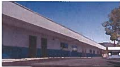
George Washington ES