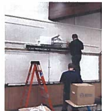
Typical 21st Century Classroom

The District installed network cabling and wireless access points at Burbank HS, Burroughs HS, Muir MS, Luther MS, and Adult School. In addition, a new Data Center was constructed at the District Service Center. This includes a dedicated room for the new District IT racks which house new servers, switches, routers, and fire wall. Also included in the Data Center is an uninterruptable power system and a standby generator for power failure situations.