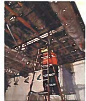
Fire Sprinkler Installation