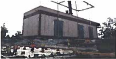
George Washington ES