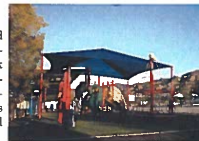
Thomas Jefferson ES