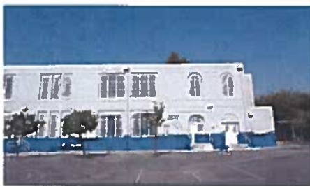
George Washington ES