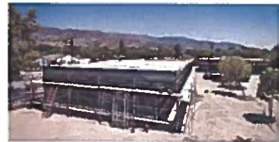
George Washington ES