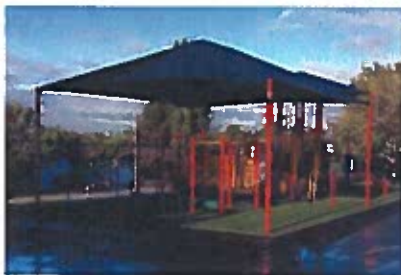
Thomas Jefferson ES

A new playground structure was completed at the Jefferson ES playground. This included construction of a metal framework shade structure with a fabric cover and installation of a synthetic cushioned play surface. Also, new asphalt and striping was installed at Muir MS, Providencia ES, and Jefferson ES lower playground.