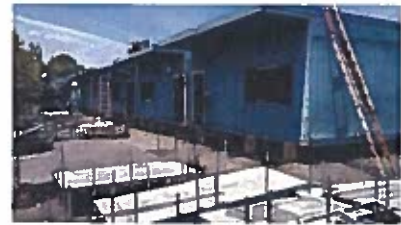
George Washington ES

The District removed all of the old portable classroom buildings at Washington ES and Roosevelt ES. New modular buildings were installed and constructed in record time. The new modular classrooms at Roosevelt ES and Emerson ES were available for use by fall of 2016 and the new modular classrooms at Washington ES shortly thereafter. The new classrooms include many upgrades compared to the old classrooms. These upgrades include built in teaching walls, better quality and more efficient LED lighting, and improved heating and cooling systems. In addition, each classroom has an ADA compliant sink and upgraded resilient flooring. Plus, these classrooms have been modernized with 21st Century teaching technology and improved wireless equipment. Furthermore, the new classroom buildings are furnished with a new code compliant fire alarm system. Lastly, a energy management system (EMS) has been incorporated into all the new classroom buildings.