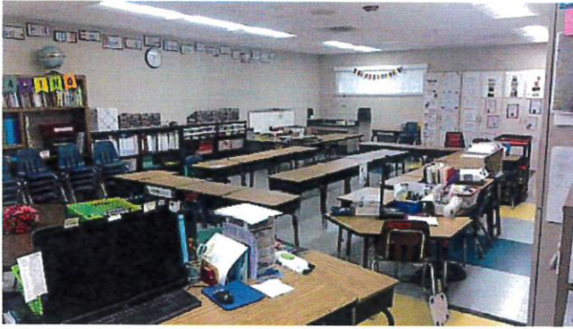
Stevenson Interior Classroom