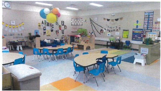
Horace Mann Interior Classroom

The new modular classrooms include many upgrades compared to the old classrooms. These upgrades include: