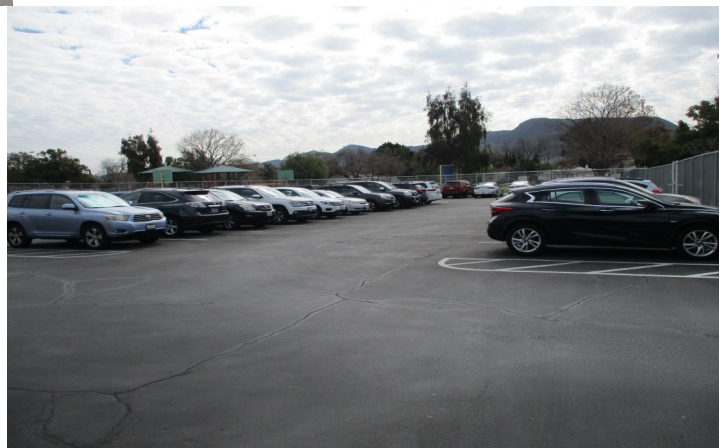
Roosevelt parking lot expansion doubling the capacity