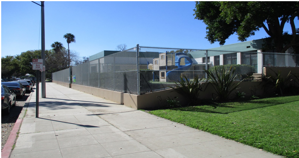
McKinley School receives new “No Climb” fencing around the front of both sides of the front of the campus including the parking area