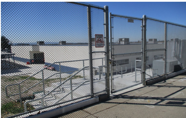
Jefferson Elementary finished Utility access gate, stairs and hillside on Karen Street