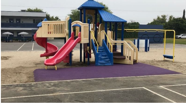
Bret Harte playground upgrades and safety improvements have been completed