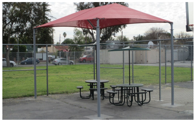
Monterey Shade Structure