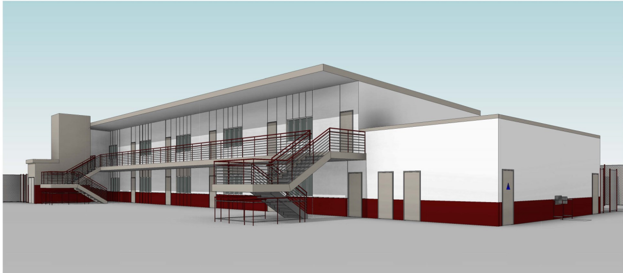
NEW CLASSROOM BUILDING WALT DISNEY ELEMENTARY SCHOOL JANUARY, 2020

Disney Elementary School plans submitted into DSA July of 2019. Plans are expected to be approved and stamped out of DSA spring of 2020