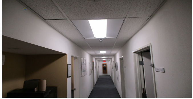
LED lighting Upgrades throughout the District including interior and exterior lighting have been completed