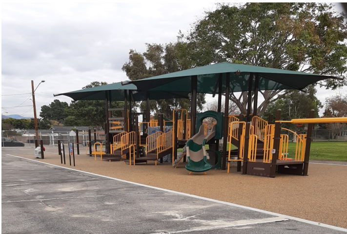
First Phase of Playground Improvements completed- New Expanded Roosevelt Playground