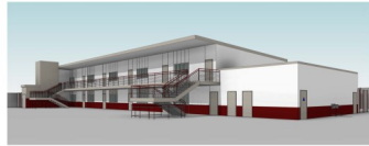
NEW CLASSROOM BUILDING NEW 2-STORY MODULAR CLASSROOM BUILDING PROJECT #202