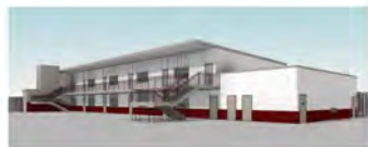
Disney Elementary Campus Layout New Two-Story Modular Building with New Expanded Sports Field