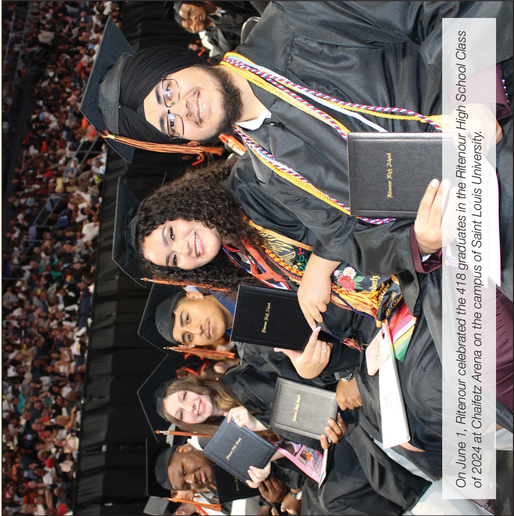
On June 1, Ritenour celebrated the 418 graduates in the Ritenour High School Class of 2024 at Chaifetz Arena on the campus of Saint Louis University.