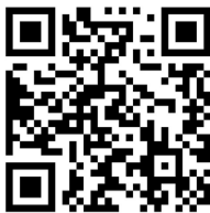
Use your camera app to scan this QR code on your smartphone to view photos and more information about new administrators.