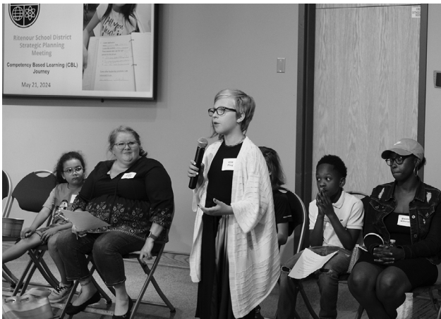
Ritenour hosted three strategic planning sessions last school year to gather feedback about the move to competency-based education. The district will have full implementation of the innovative approach this school year.

Parents and guardians can expect to see their children's progress in each subject area using a 1-4 scale to indicate proficiency levels. Letter grades (A's, B's, etc.) no longer will be used in any K-8 classes. RHS will use both letter grades and the 1-4 scale. The district will be using a new platform, called Empower, that will give parents and guardians access to view their children's standards-based grades.