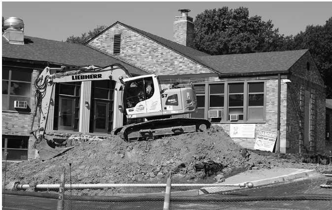
Construction to complete a new entryway at Buder Elementary is expected to be completed by the beginning of the 2024-2025 school year. The update, funded by the Proposition S bond issue, is being made to increase the security at the building.

Thanks to the community's tremendous support of the Proposition S bond issue, improvements continue throughout the summer of 2024 with the construction of new secure main entrances at six Ritenour sites.