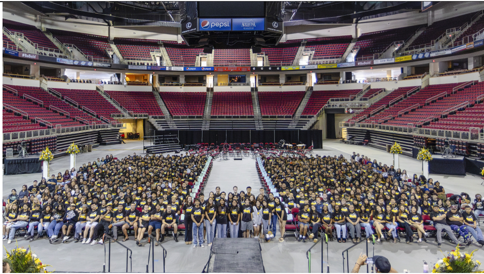
EDISON HIGH SCHOOL CLASS OF 2024