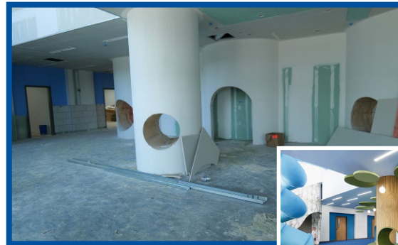
West Early Learners Academy