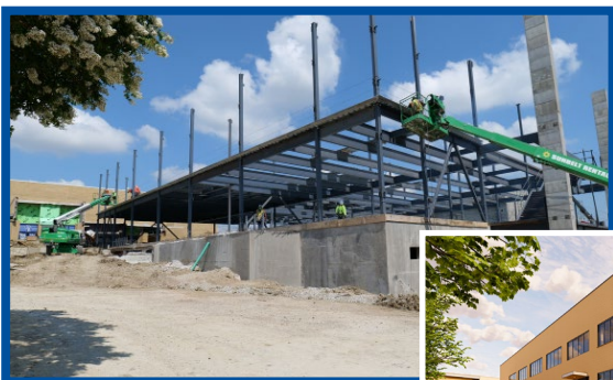
6th Grade Center