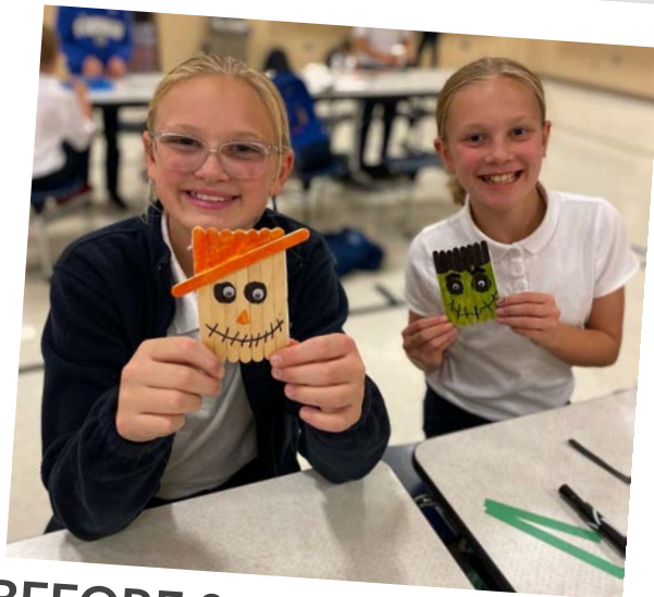
BEFORE & AFTER SCHOOL CARE PROGRAM

Contact Information: If you know your child/ren will not be attending or have different plans for pick-up, please call or email the school office as soon as possible. If you need to contact the After School Care Staff between 2:45pm-6:00pm, please call 605-940-4986.