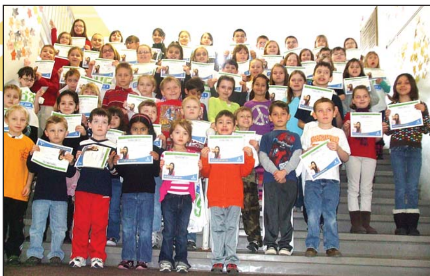
St. Jude's Marathon: Students participated in the Mathathon program to benefit St. Jude's Research Hospital, raising a total of $3,309. Over the eight years Boardmanville students have participated in Mathathon they have raised $18,565.53 to benefit sick children. Our students also collect and donate pull-tabs from cans to benefit St. Jude's. This year they brought in about 261,000 tabs to raise $125. Way to go Boardmanville students and parents!