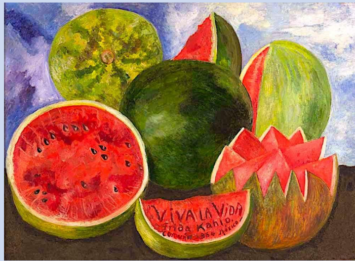
Viva la Vida, Watermelons (1954)" -The last painting by Frida Kahlo (1907-54)