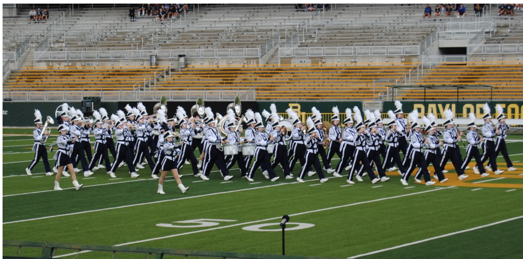
LEFT: The band marches in the preliminary round of state competition Oct. 24 in Waco.