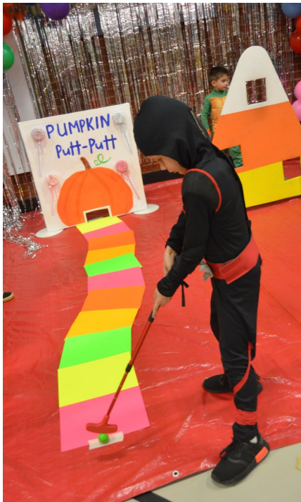
LEFT: First grade parents made a pumpkin putt-putt game and a candy corn bean bag toss that tested students' athletic prowess.