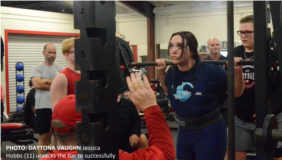
squat 320 lbs, a new personal record.