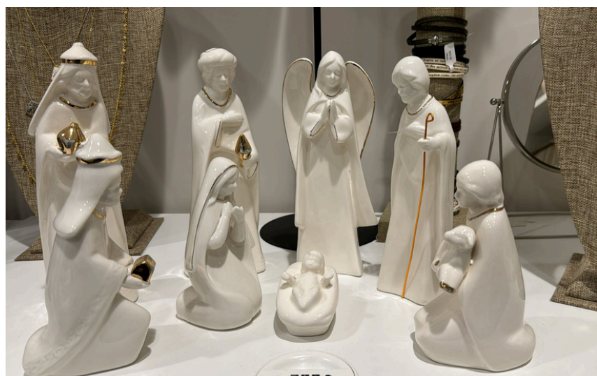
Located in the entrance of the church. Volunteers needed.

Open Mon. - Fri. 8:30 - 9:00 AM Wed. 11AM - 2:00 PM Sun. 11AM - 2:00 PM