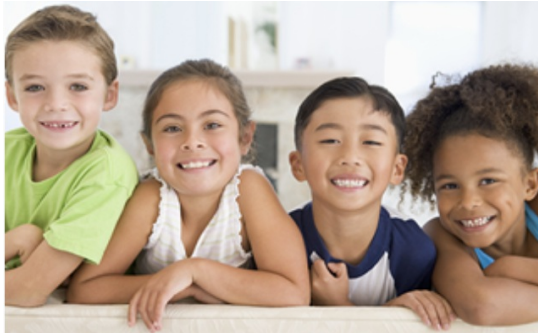
The 2019-20 academic year in San Bernardino County begins in August for K-12 schools.

students and partnering with our families and communities to provide the best educational opportunities for our children as we prepare them to be college and career ready in their academic pursuits. Best wishes for the start of the 2019-20 academic year!