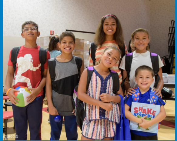
A backpack giveaway and resource fair was held on July 30 in Adelanto at Mesa Linda Middle School. See the photos.