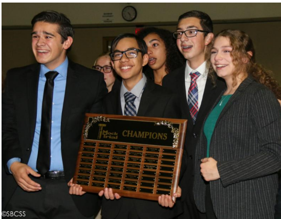
Cajon High School claimed its first San Bernardino County Mock Trial title on Dec. 8.

This year's competition was fierce with Los Osos, Redlands and Redlands East Valley joining Cajon in the semifinals from the