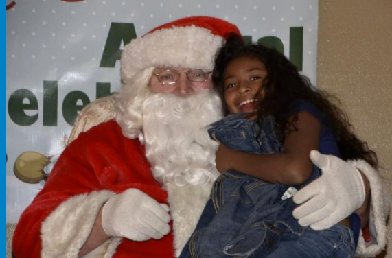
Children Deserve Success of the San Bernardino County Superintendent of Schools held its annual Holiday Celebration to benefit students and families on Dec. 10 at the Elks Lodge in San Bernardino.

Cajon will be celebrated, along with all countywide individual and team award winners, at the annual Mock Trial Awards celebration, which will be held on Jan. 15 at the DoubleTree Hotel in Ontario. As county champs, Cajon's team also advances to the California Mock Trial competition, which will be held in March in Sacramento. Congratulations to all of the outstanding teams and students, who shined in this year's thrilling competition!