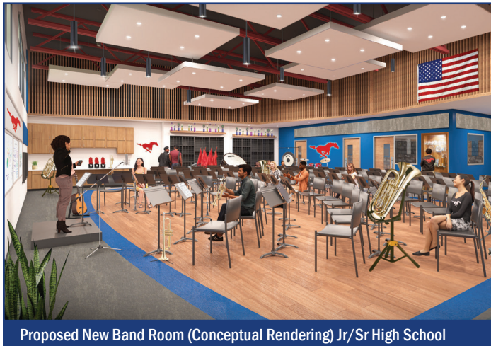
Proposed New Band Room (Conceptual Rendering) Jr/Sr High School