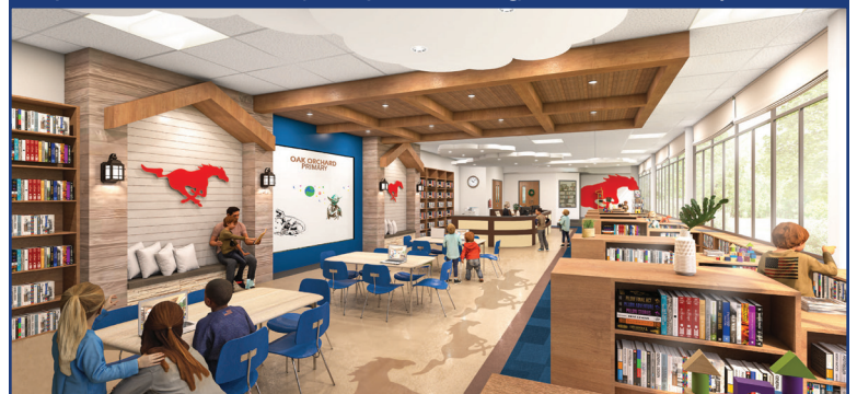
Proposed New Media Center (Conceptual Rendering) Oak Orchard Primary