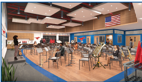
New Band Room (Conceptual Rendering) Jr/Sr High School