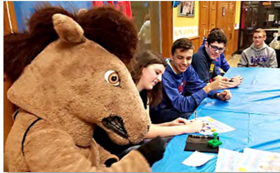
Maverick and the rest of the High School stars sign autographs.

The "stars" signed autographs, including school mascot, Maverick, and spent some time with students telling them that they are stars too!