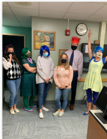
CW Office Staff and counselors.

Students and staff at Clifford Wise Intermediate brought their A game as far as coming up with some fun and creepy costumes.