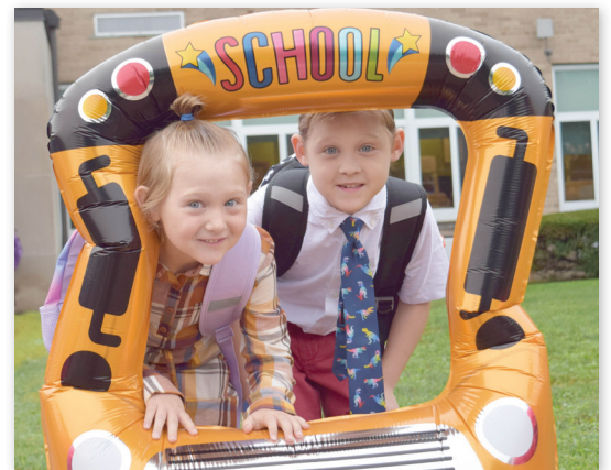
Students enjoying the balloons on the front lawn of Oak Orchard.