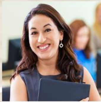
THE MID-CAREER PROFESSIONAL