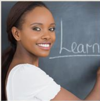
THE EARLY-CAREER TEACHER