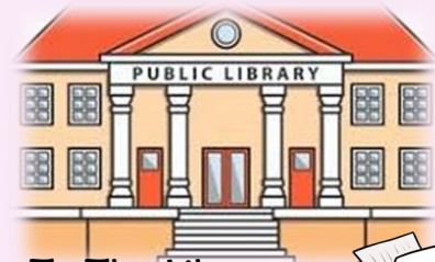
Go To The Library