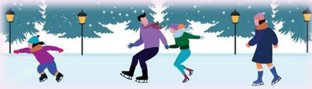
Go Ice Skating