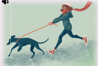
Walk Your Dog