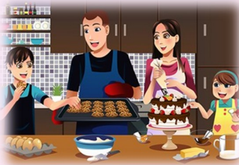
Family Bake/Cook Day