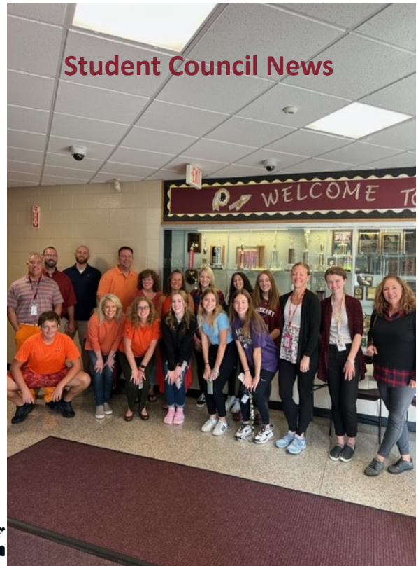
Student Council News