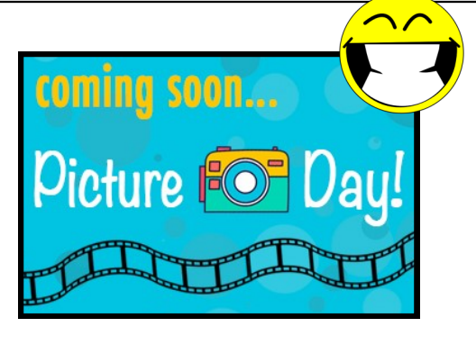
School Picture Day Friday, September 10th