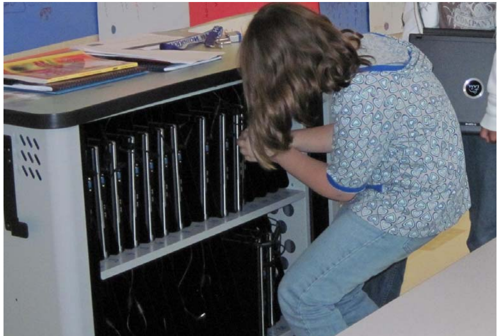
Proper use and care will ensure these C.O.W.s stay healthy for many years.