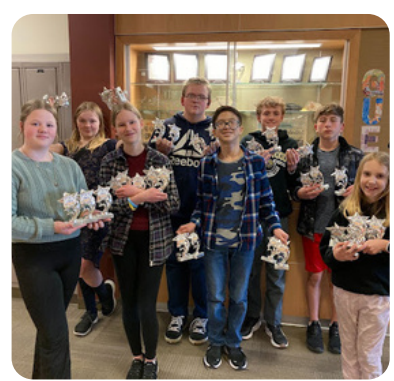
Westwood Middle School FBLA student pose with their trophies.

Cheney Public Schools does discriminate in any programs or activities on the basis of sex, race, creed, religion, color, national origin, age, veteran or military status, sexual orientation, gender expression or identity, economic status, pregnancy, familial status, marital status, disability, or the use of a trained dog guide or service animal, and provides equal access to the Boy Scouts and other designated youth groups. The following employees have been designated to handle questions complaints of alleged discrimination.