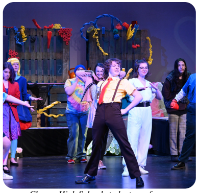
Cheney High School students perform SpongeBob. The Musical in early May.