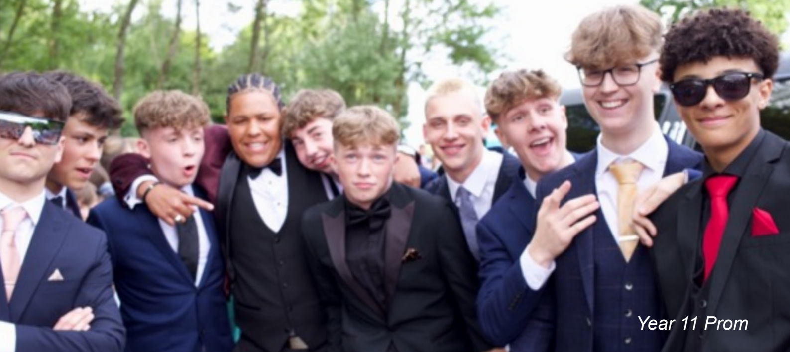
Year 11 Prom