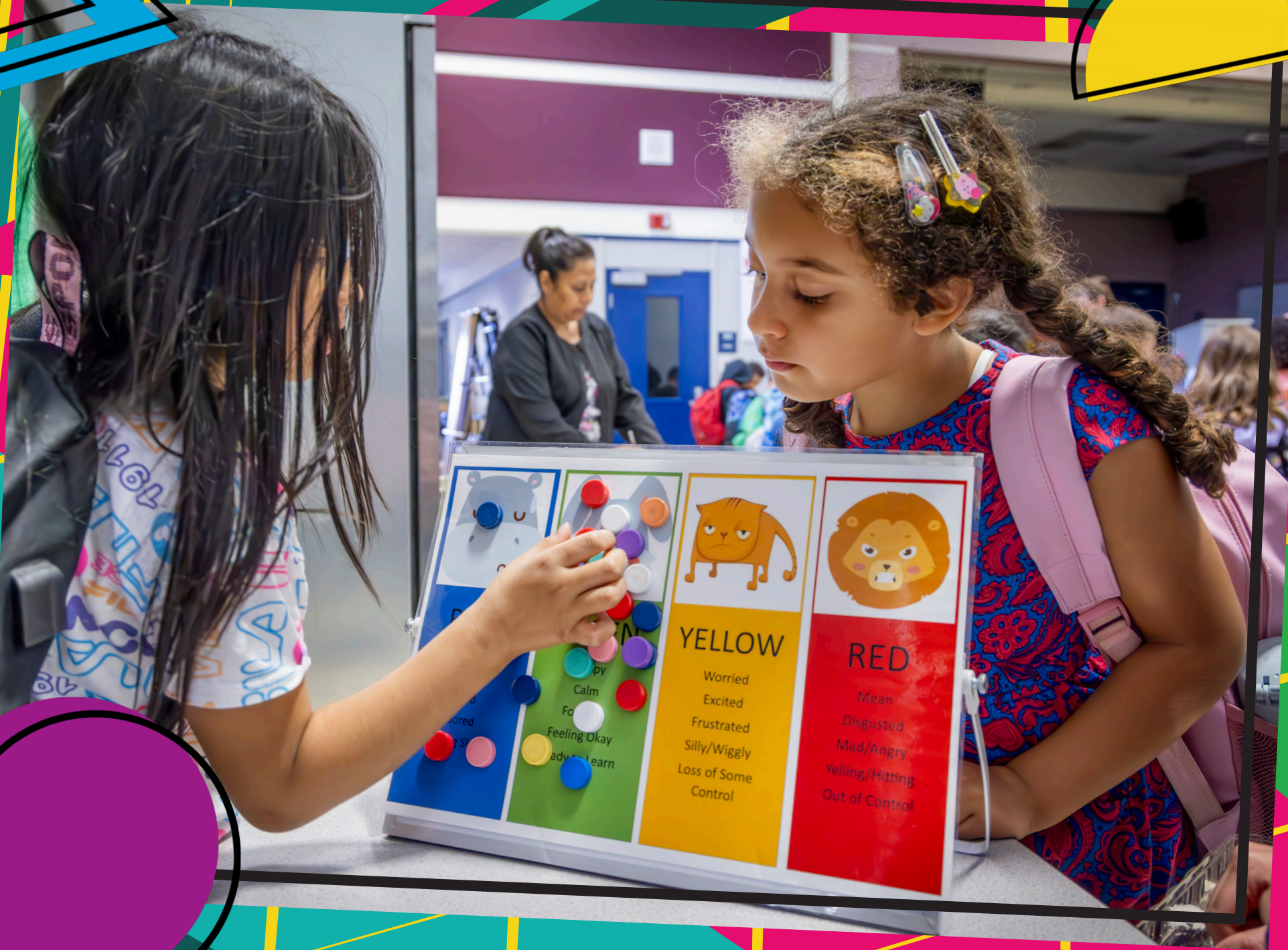
Students and Edison Elementary School use a zones of regulation chart to check-in for Beyond the Bell afterschool programming.