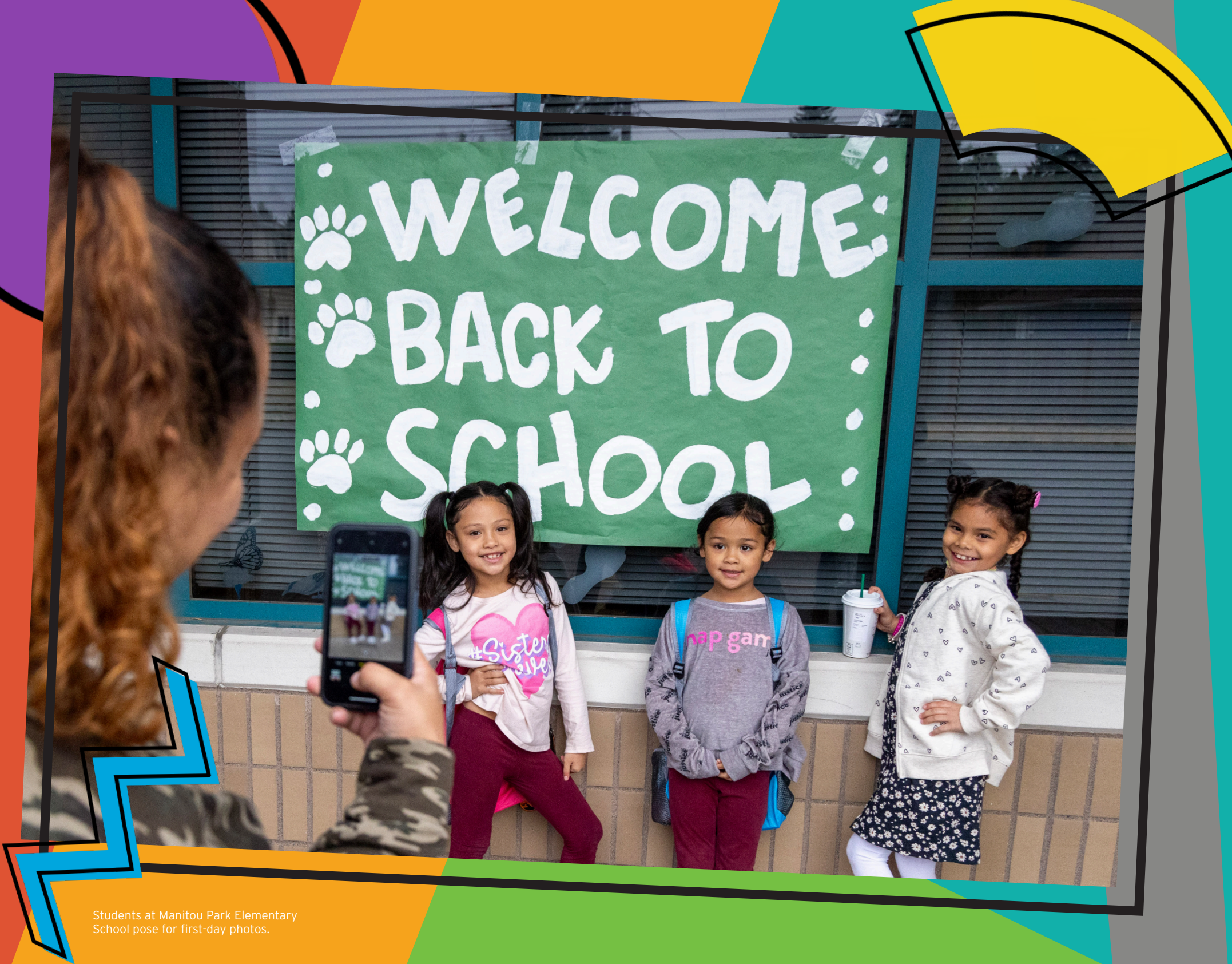
Students at Manitou Park Elementary School pose for first-day photos.