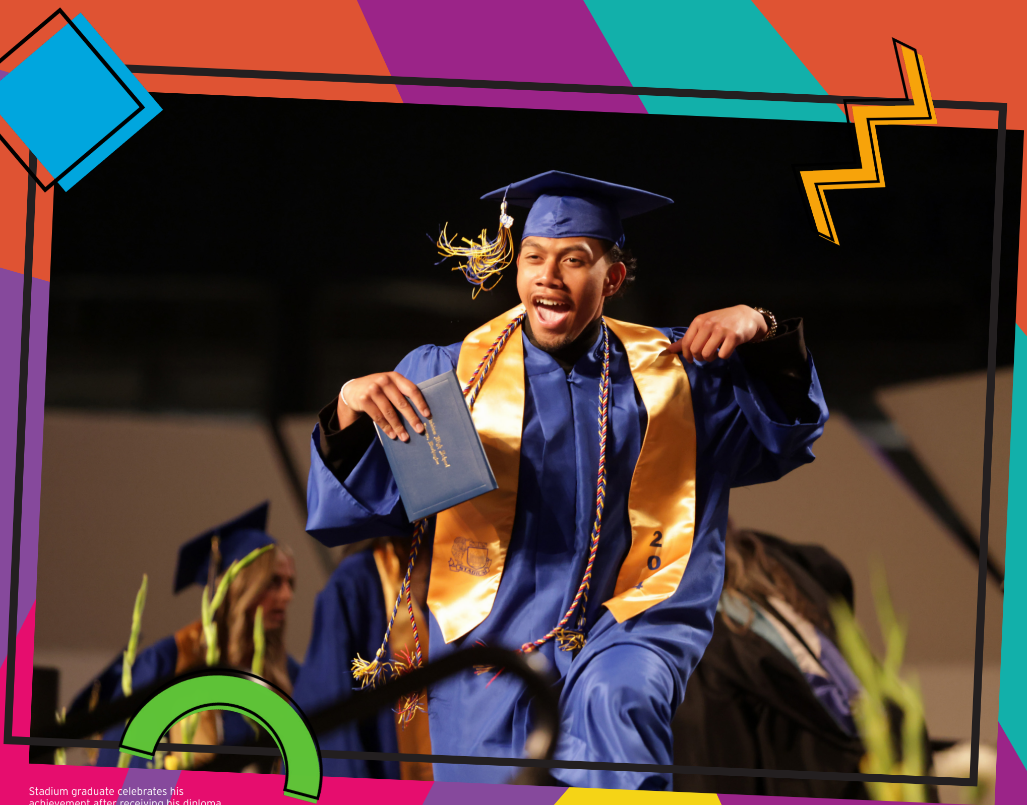
Stadium graduate celebrates his achievement after receiving his diploma.