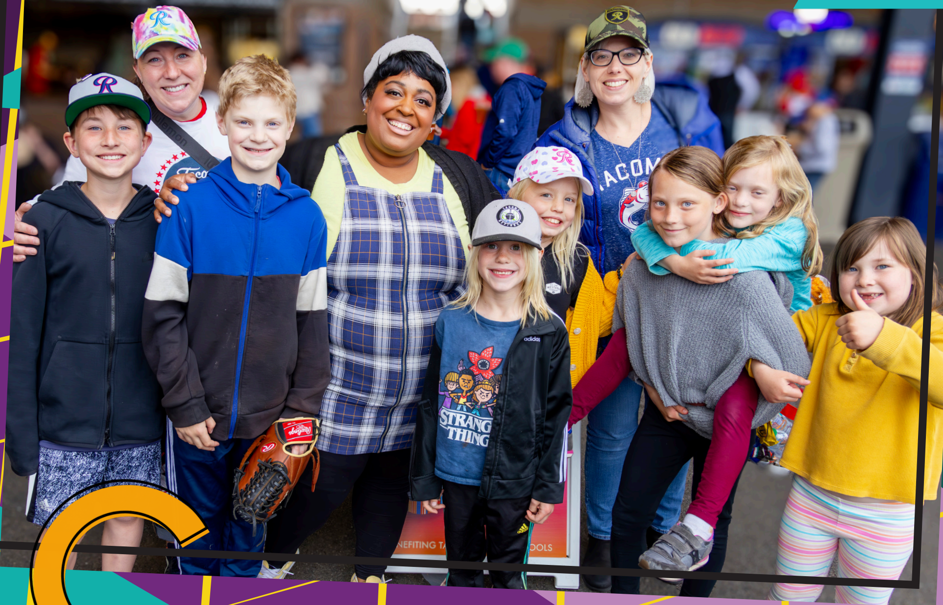
Tacoma Public School families and staff gather for the annual TPS Night at the Rainiers baseball game.