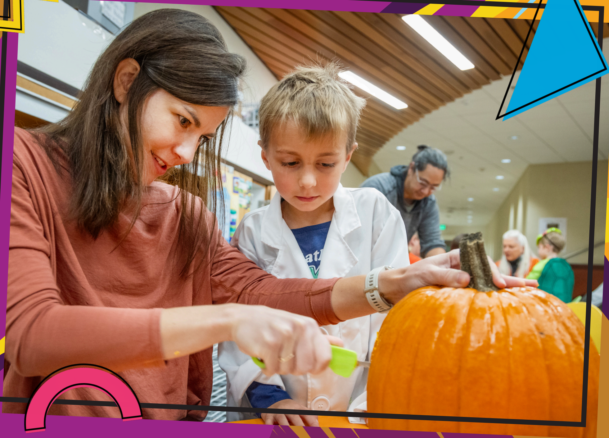
Family volunteers help kindergarten students and Washington Elementary School carve pumpkins.