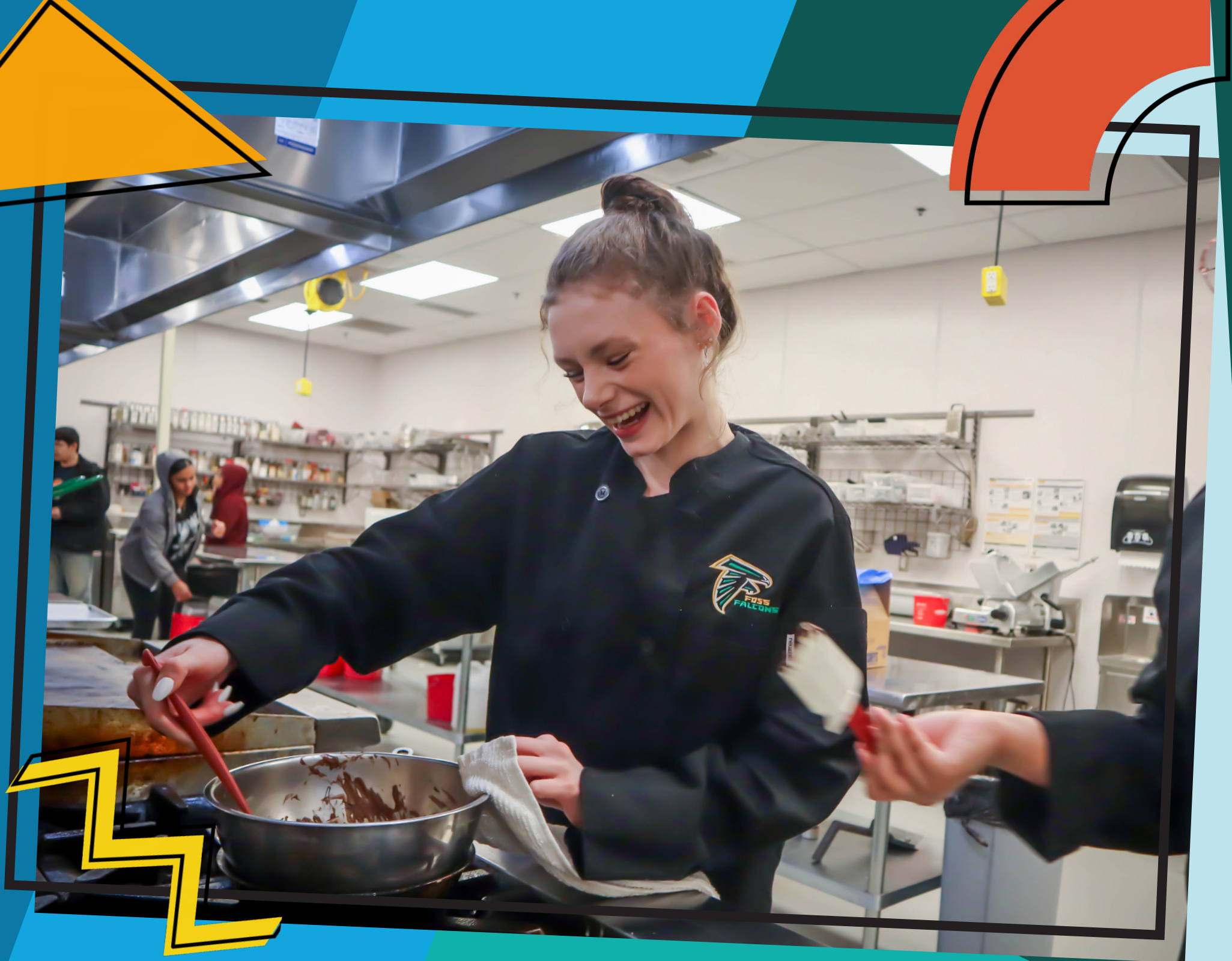
A culinary student at Foss High School melts chocolate for her dessert creation.