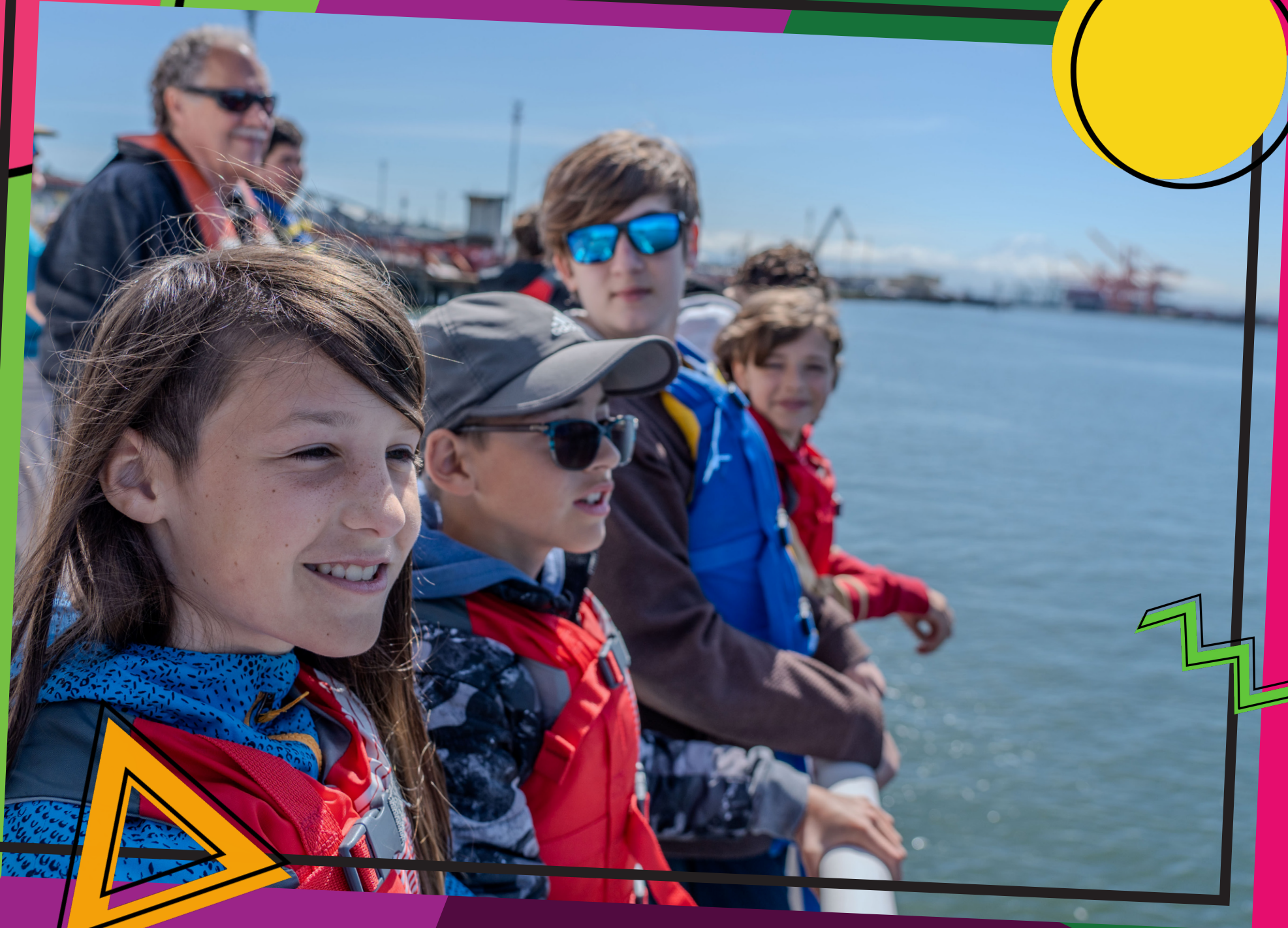
Hilltop Heritage Middle School students look out at Commencement Bay during a science field trip.