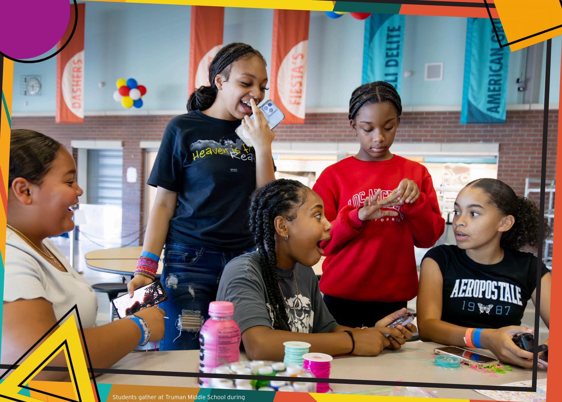
Students gather at Truman Middle School during out of school hours through partner programming.