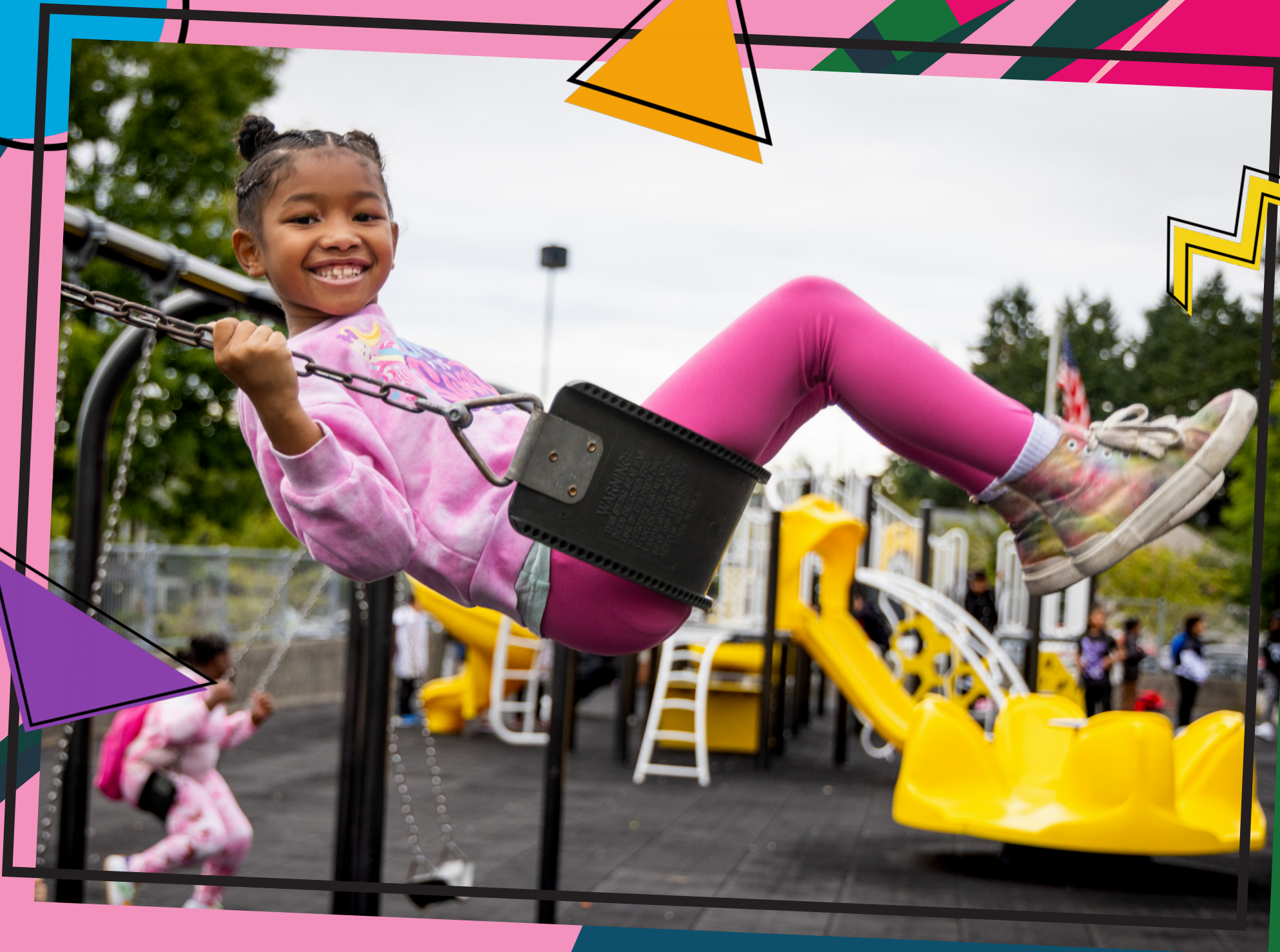
Lister students make good use of their playground during recess.