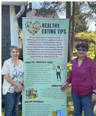
CICC-CCC staff by the CHSC Nutrition banner

The CICC-CCC Food Pantry, located in Central Islip, serves over 4,000 adults and children in the community, providing emergency food supplies. Additionally, the Council operates a thrift store with proceeds supporting the organization. The pantry's organic vegetable garden also contributes fresh herbs and produce to its guests. While collaborating with Ms. Rios on various wellness initiatives such as indoor and outdoor growing projects, she expressed a desire to donate produce to a local pantry. As CHSC was in the process of providing nutrition banners to the CICC-CCC pantry to promote healthy foods, the opportunity arose to facilitate this generous donation.