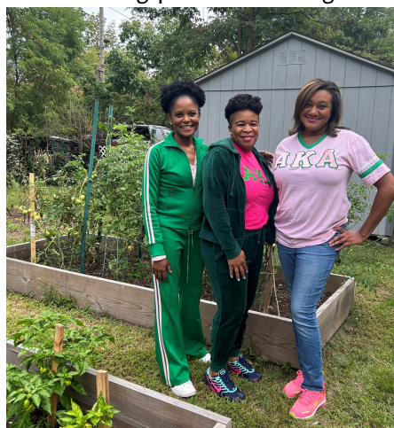
Sorority members in the garden

CHSC is excited to continue our collaboration with the CICC-CCC Food Pantry, the Middle School, and the Theta Iota Omega Chapter. Together, we aim to make healthier choices more accessible for the community, create more opportunities for physical activity, and work on chronic disease prevention. By combining our efforts in nutrition education, gardening projects, and wellness initiatives, we hope that the people who visit CICC-CCC have the resources and support needed to lead a healthier lifestyle. We look forward to continuing this partnership and watching our shared efforts turn into lasting positive change.