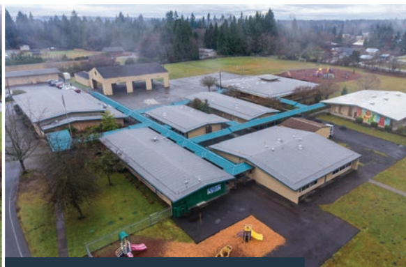
Cathcart Elementary, students travel between 7 separate buildings