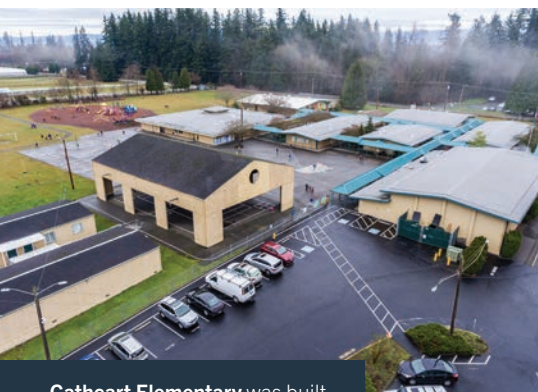
Cathcart Elementary was built in 1966, expanded in 1970 and 1980, and renovated in 1993.