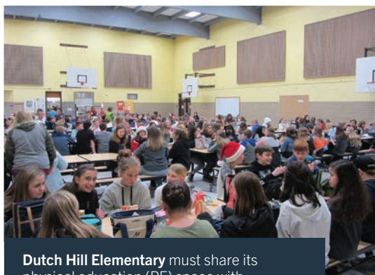
Dutch Hill Elementary must share its physical education (PE) space with lunchroom space. Each day four periods of lunch are served here displacing PE classes.