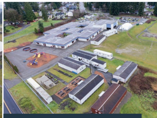
Seattle Hill Elementary, 72% over capacity with 12 portable classrooms