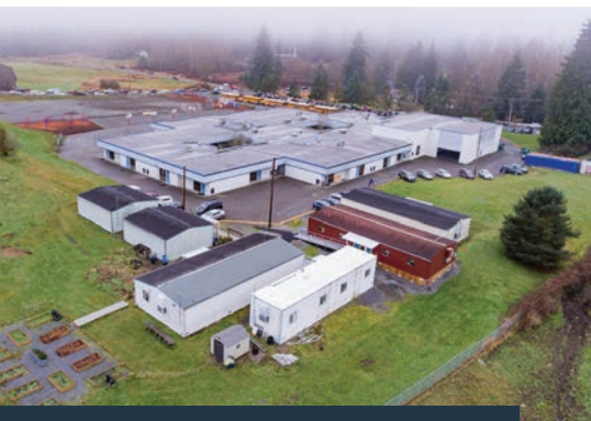
Dutch Hill Elementary, 52% over capacity with 9 portable classrooms