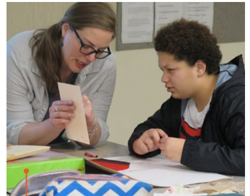
Centennial Middle School

Cathcart Elementary is a four-time repeat winner having received this achievement in 2015, 2016, 2017 and 2018 Seattle Hill Elementary is a three-time winner for its 2016, 2017 and 2018 achievements. This is the second year (2017 and 2018) that Centennial Middle School has been recognized. All three schools were recognized at a January 2019 Snohomish School District School Board meeting.