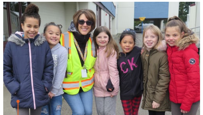
Seattle Hill Elementary

Cathcart Elementary is a four-time repeat winner having received this achievement in 2015, 2016, 2017 and 2018 Seattle Hill Elementary is a three-time winner for its 2016, 2017 and 2018 achievements. This is the second year (2017 and 2018) that Centennial Middle School has been recognized. All three schools were recognized at a January 2019 Snohomish School District School Board meeting.