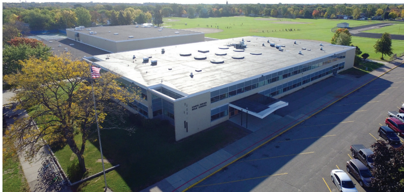
1120 15th Ave S, St. Cloud, 320-370-7230

Clearview and Oak Hill at the elementary level will transition to South. Students from Discovery and Lincoln will attend either North or South depending on where they live. Spanish Immersion students continue their immersion education at South beginning in grade 6. Students who attend South complete their high school education at Tech High School.