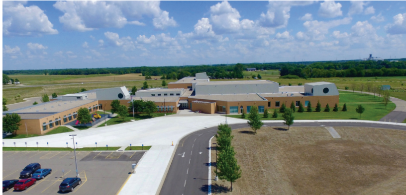
1300 Jade Road, St. Joseph, 320-370-7430

Home of the Colts, Kennedy Community School is located in St. Joseph on the western side of our District boundaries and educates students in grades PreK-8. In 2012, Kennedy was named a Green Ribbon School by the U.S. Department of Education. Honored schools exercise a comprehensive approach to creating "green" environments by reducing environmental impact, promoting health and ensuring a high-quality environmental and outdoor education. Kennedy inspires all students through hands-on learning opportunities in its gardens and prairies, and celebrates collaboration through its community partnerships, including the Sauk River Watershed District and College of St. Benedict. Students who attend Kennedy will complete their high school education at Apollo High School located in west St. Cloud.