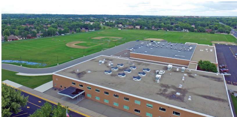
1212 29th Ave N, St. Cloud, 320-370-7000

According to the school boundary areas, students who attend Madison and Westwood at the elementary level will transition to North. Students from Discovery and Lincoln will attend either North or South depending on where they live. Additionally, North is home to the middle level Chinese Immersion program. Students who attend North complete their high school education at Apollo High School.