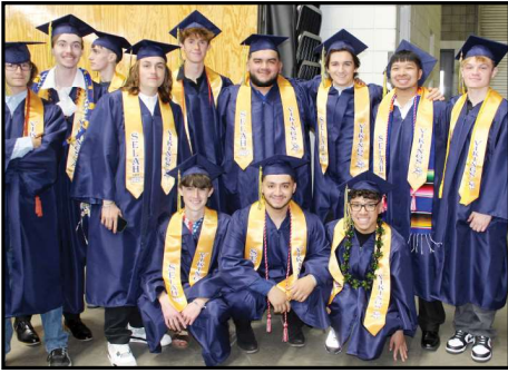
Selah High School students celebrated graduation on Saturday, June 1, at the Yakima SunDome. Congratulations!