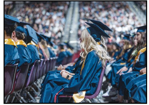
In front of a packed crowd of supporters, the Viking Class of 2024 graduated 270 members.