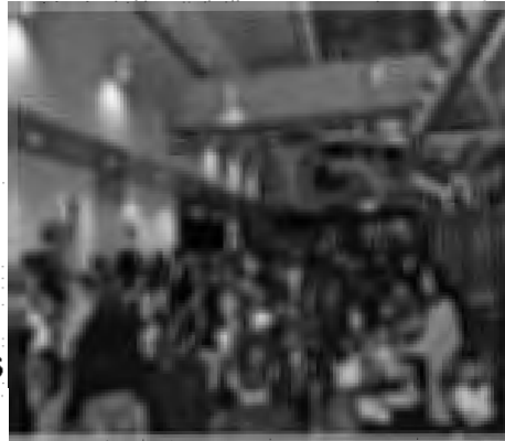
Charlotte Bobcats Trip