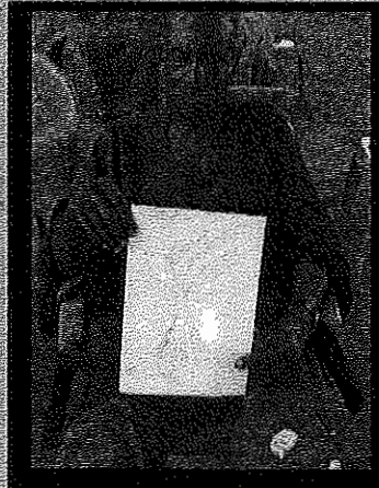
A Chief in Ghana's Tree