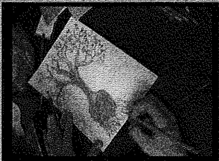
A Boomerang Student's Tree

In 2008, the Center for Creative Leadership took Boomerang's Tree exercise to Ghana and had local village members complete their own strengths assessment!