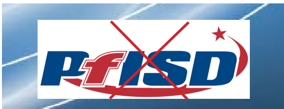
JPG file format