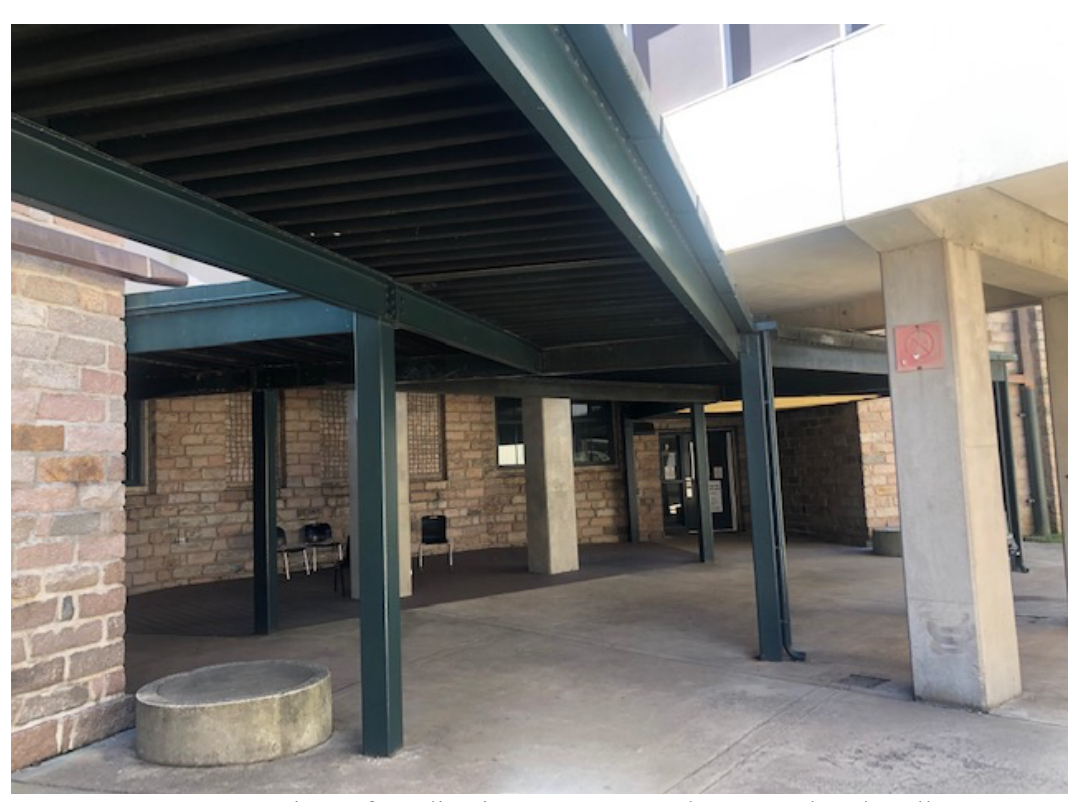
Photo No. 2 – View of Auditorium Canopy under upper level walkway.