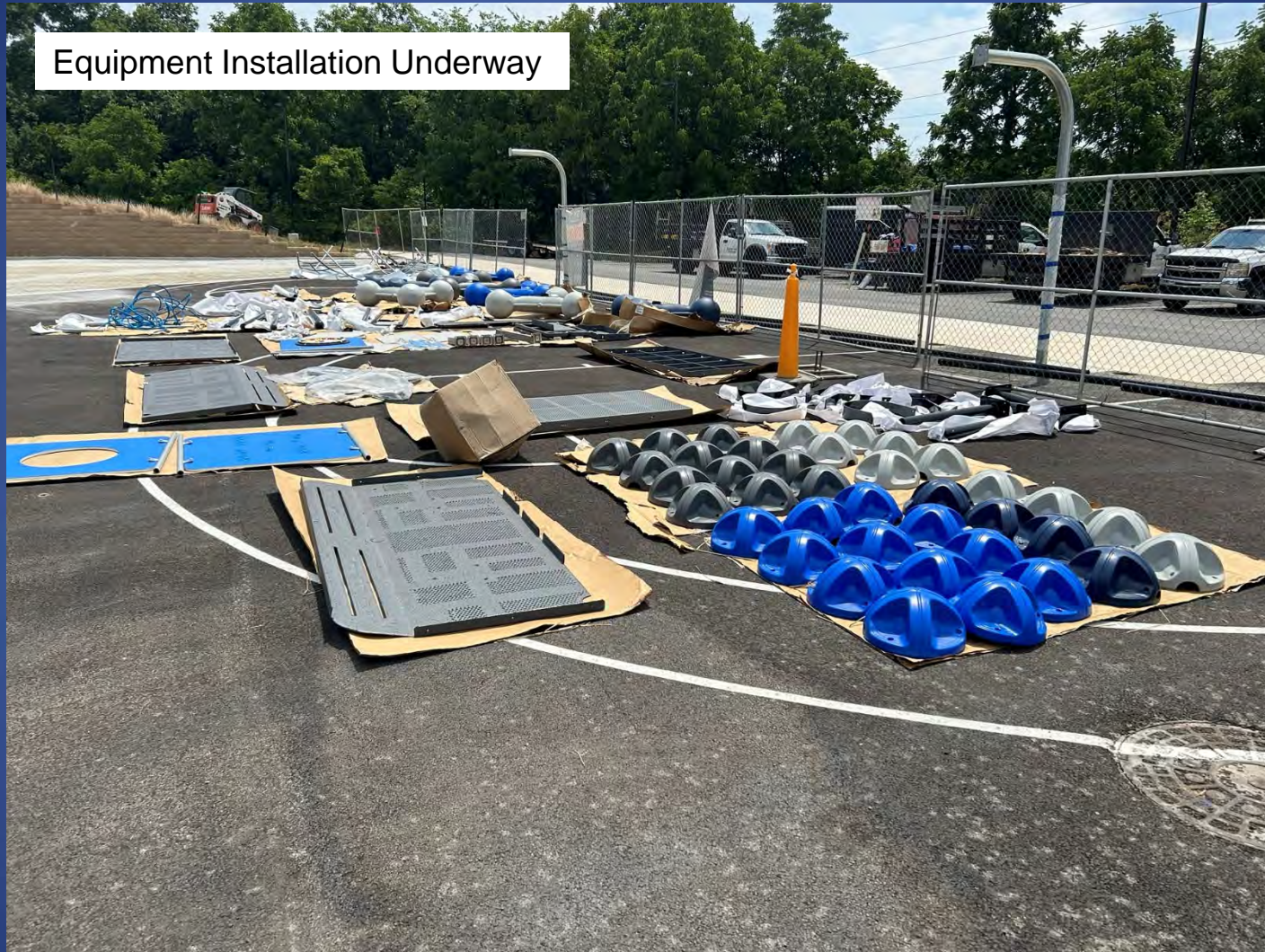
Equipment Installation Underway